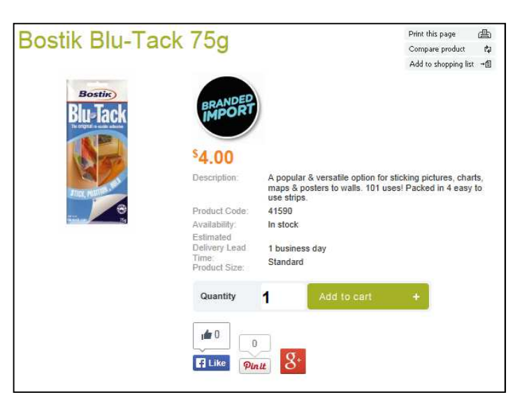
Figure 3 - Example of Warehouse Stationery marketing of "branded import" products