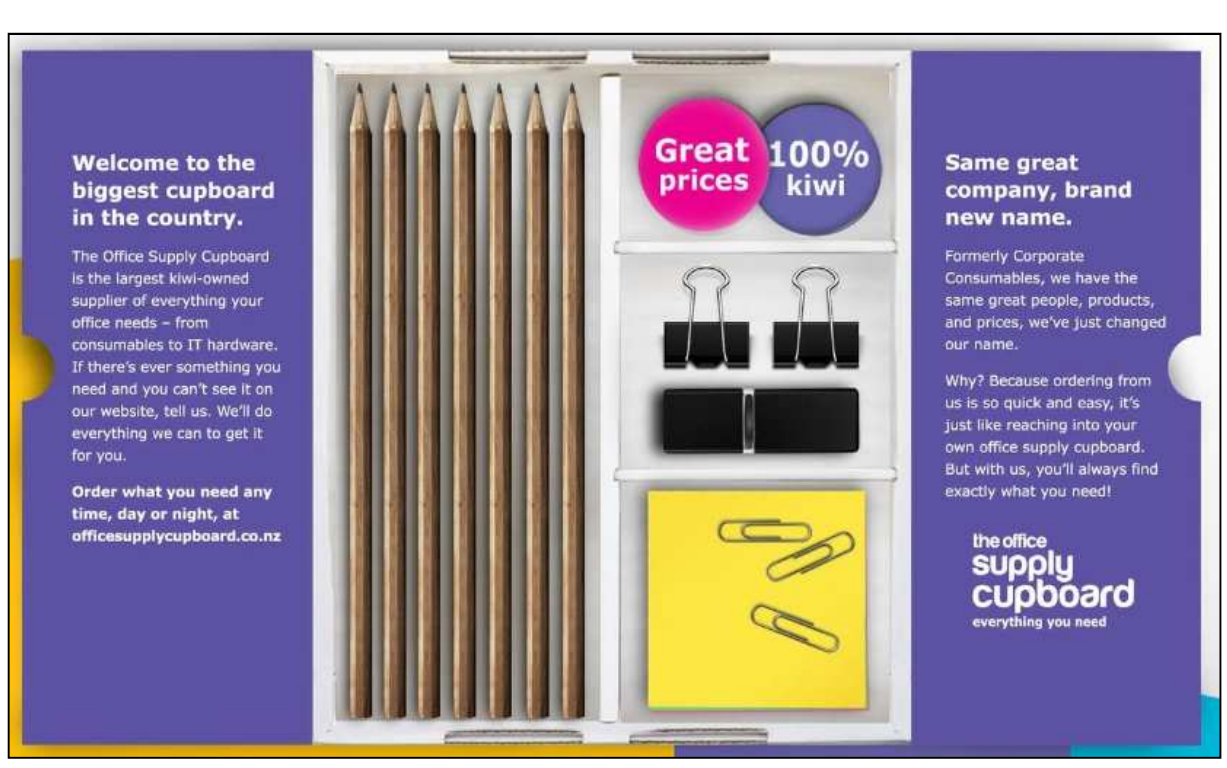
Figure 2 - The proposed rebranding of Corporate Consumables as "The Office Supply Cupboard"