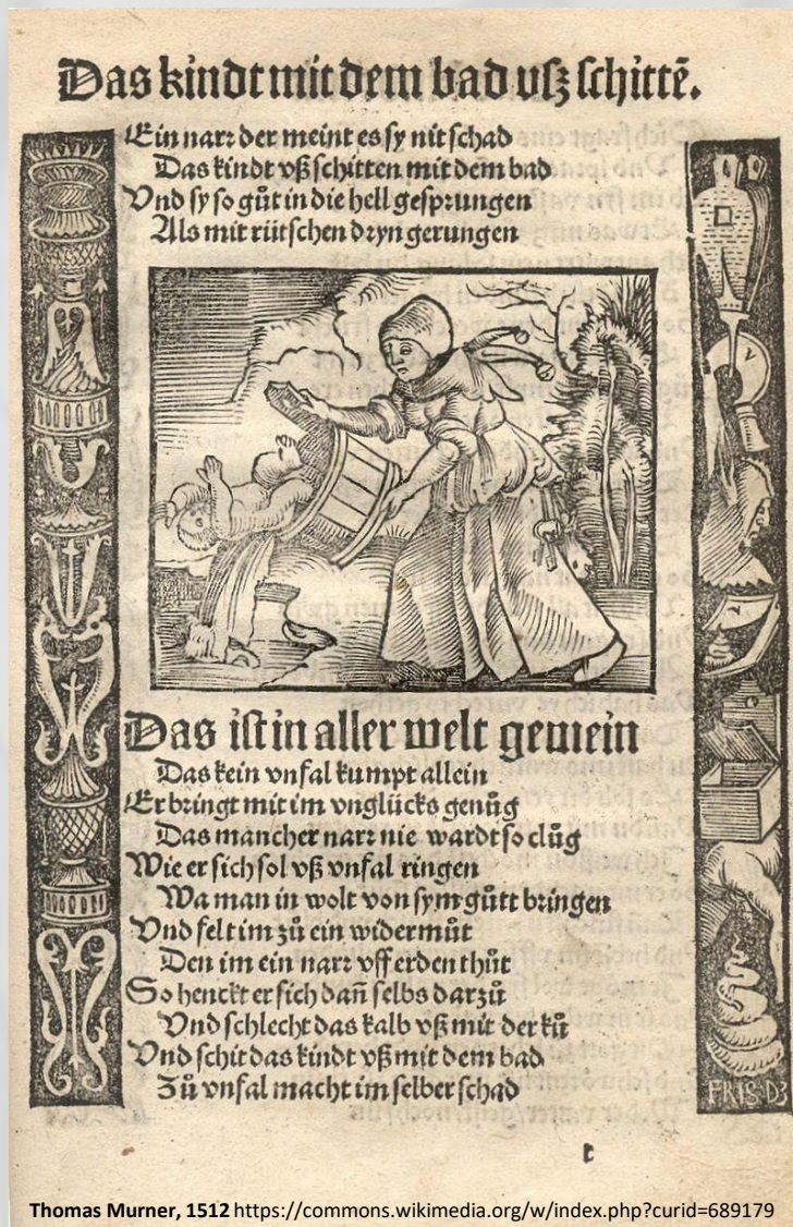
Thomas Murner, 1512 https://commons.wikimedia.org/w/index.php?curid=689179