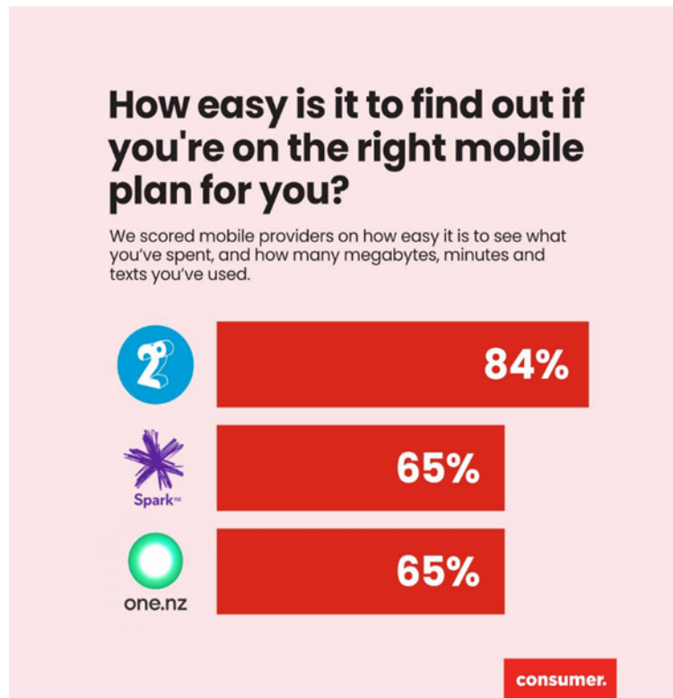
Figure 3: Consumer NZ 2023 Review Results 11