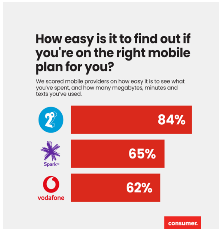
Figure 2: Consumer NZ 2022 Review Results 9