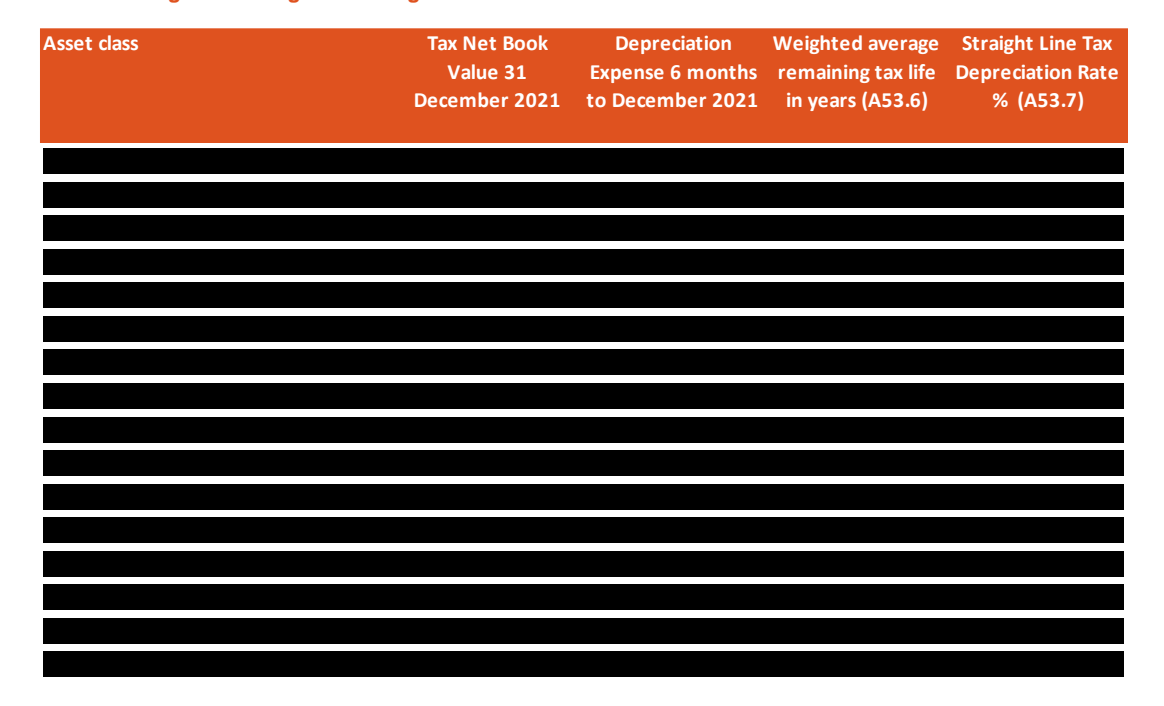
Table 21 Weighted average remaining tax life

Sum of tax net book value for individual assets at December 2021 Sum of tax depreciation for individual assets for December 2021 financial loss year