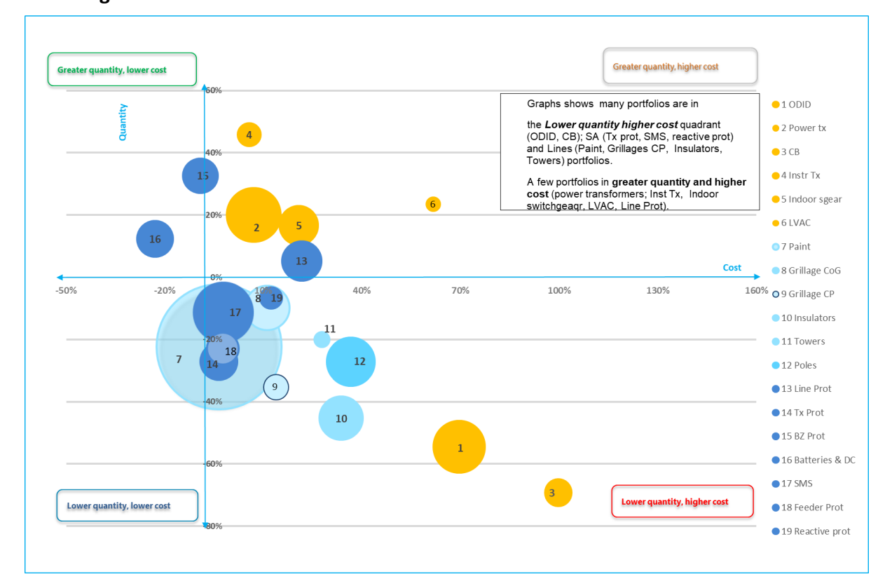
Figure 3.1 Cost and volume variance of main standard deliverables vs RCP3<sup>36</sup>