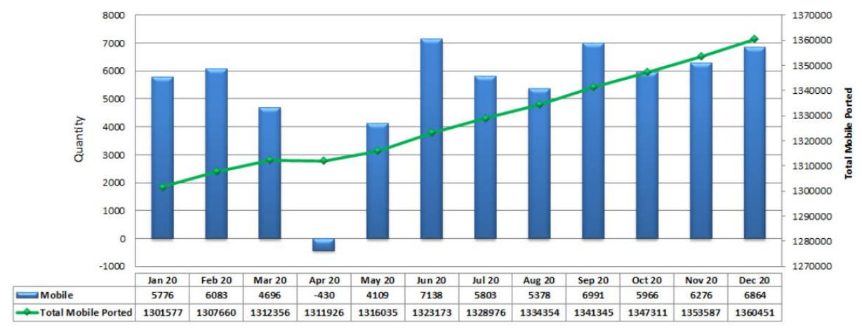
Figure 3: Mobile Number Ports