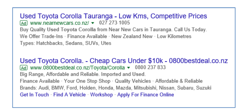
Figure 6 – Example of vehicle dealers using Google advertisements