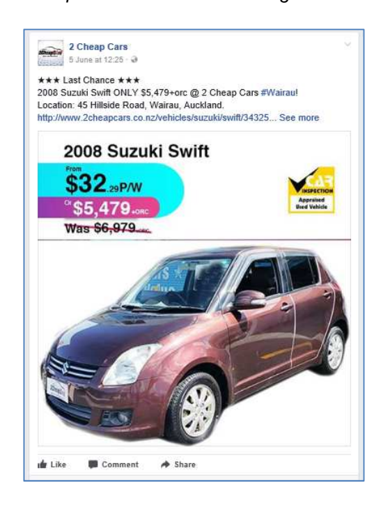
Figure 7 – Example of vehicle dealers using Facebook advertisements<sup>28</sup>