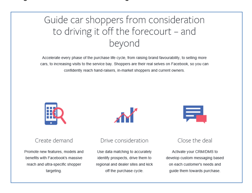
Figure 8 – Facebook's marketing of "Facebook for auto"